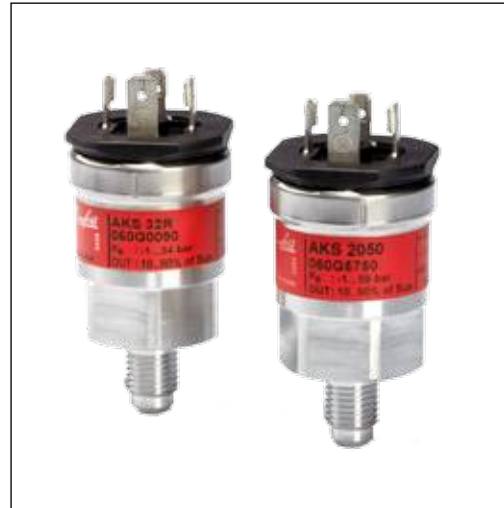
AKS 2050 is for high pressure and with pulse-snubber in the pressure connection